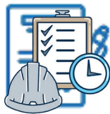
Contract / Contractor Management Services