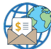
Global Payment Solutions