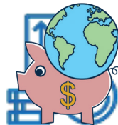
Global Payroll Services