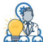
PEO & HRO