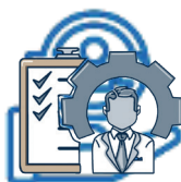
HR / IR Management