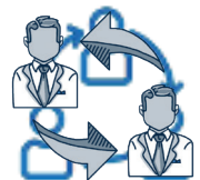
Mobility & Rotation Management