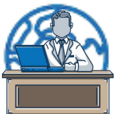
Employer of Record (EOR)

All solutions are fully compliant with local legislations.