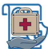
Expatriate & Local Insurance (incl. Medevac)