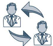
Mobility & Rotation Management