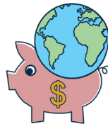
Global Payroll Services