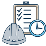
Contract / Contractor Management Services