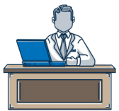
Employer of Record (EOR)

All solutions are fully compliant with local legislation.