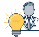
PEO & HRO