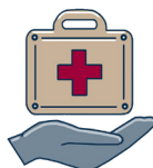
Expatriate & Local Insurance (incl. Medevac)