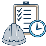
Contract / Contractor Management Services