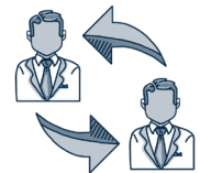
Mobility & Rotation Management