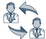
Mobility & Rotation Management