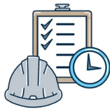
Contract / Contractor Management Services